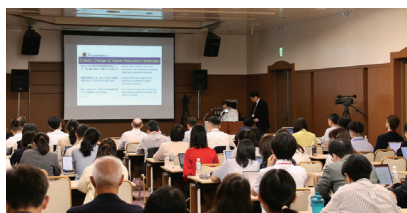
International Conference HERA 2023

Now, as we look toward the next 50 years, the Institute will continue to develop its past projects into new projects in line with the times, and to take on the challenges of new and emerging fields of research. In addition, support for international joint research and assistance to students and young researchers from many universities are part of the raison d'être of the Institute as a hub for higher education research networks in Japan and abroad. Of course, we intend to continue these programs in the future, but there is a limit to the activities that RIHE's budget alone can sustain in this uncertain economic climate. Therefore, we began fundraising for the "50th Anniversary Fund for the Research Institute for Higher Education" to reduce risk. We would like to take this opportunity to express our gratitude to those who have supported us and ask for your continuous support.