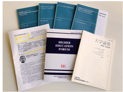
Publications at RIHE