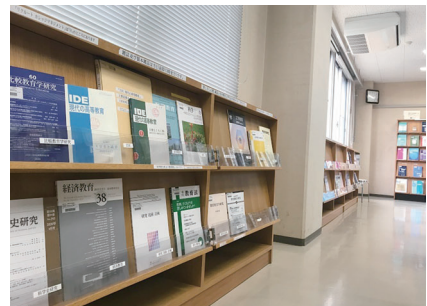
RIHE Institute Library