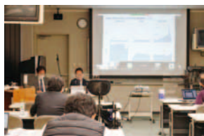
Open Seminar held both face-to-face and online

Now, as we look toward the next 50 years, the institute will continue to develop its past projects into new projects in line with the times, and to take on the challenges of new and emerging fields of research. In addition, support for international joint research and assistance to students and young researchers from many universities are part of the raison d'être of the institute as a hub for higher education research networks in Japan and abroad. Of course, we intend to continue these programs in the future, but there is a limit to the activities that RIHE's budget alone can sustain in this uncertain economic climate. Therefore, last year we began fundraising for the "50th Anniversary Fund for the Research Institute for Higher Education." We would like to take this opportunity to express our gratitude to those who have already supported us, and to ask all concerned for your ongoing support. For more information, please visit the institute's website.