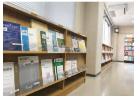
RIHE Institute Library