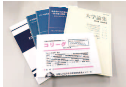
Publications at RIHE